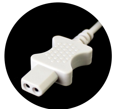
400 series connector